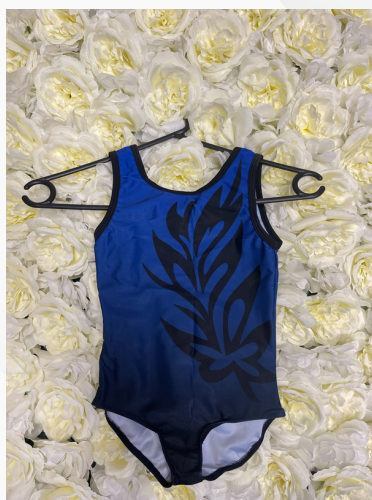
Training Leotard Available for All $70