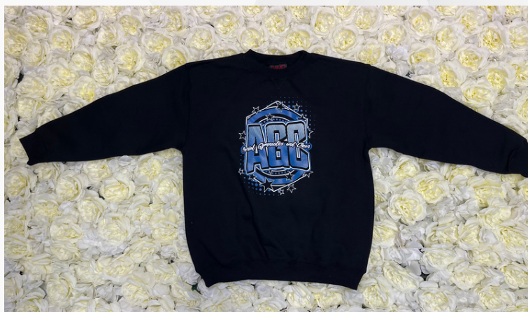
Jumper Available for All $55