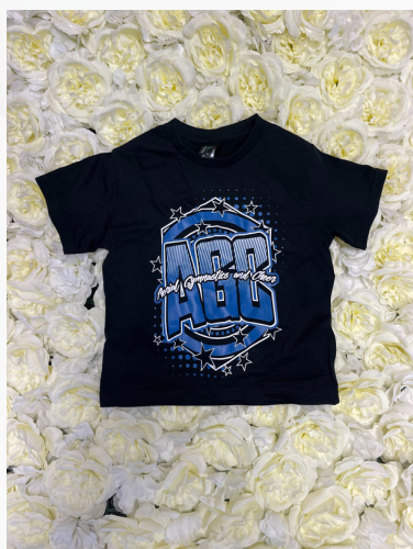
T-Shirt Available for All $30