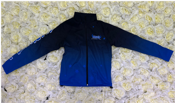
Track Jacket Compulsory for Competitive Gymnastics Available for All $60