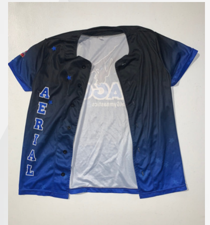
Baseball Jersey Compulsory for Cheerleading Available for All $TBD