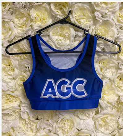
Crop Top Available for All $45