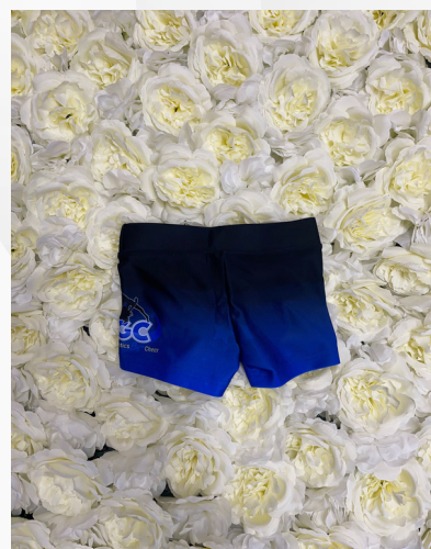
Spunks Available for All $40