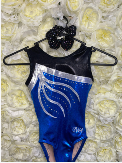
Compulsory for Level 1/2 Competition Leotard and scrunchie $90 + $15