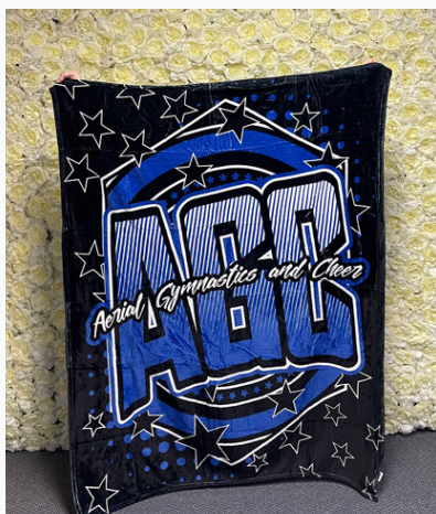
Blanket Available for All $75