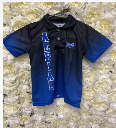
Polo Shirt Available for All $45