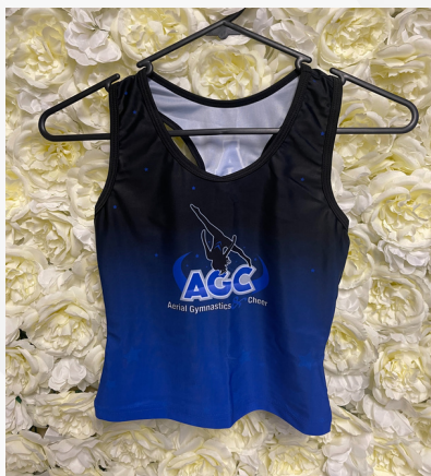
Singlet Available for All $45