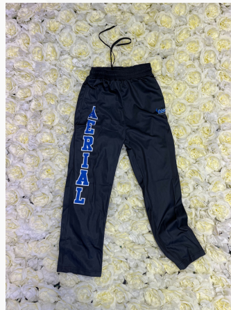
Track Pants Compulsory for Competitive Gymnastics Available for All $50