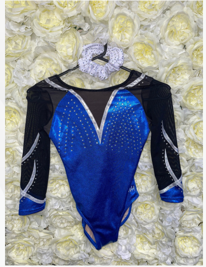
Compulsory for Level 5/6 Competition Leotard and scrunchie $170 + $15