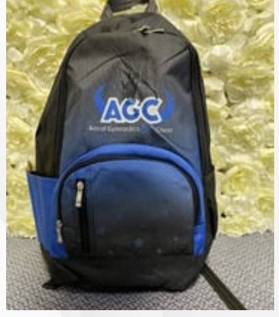
Backpack Compulsory for Competitive Gymnastics Available for All $70