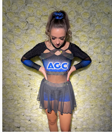
Compulsory for Cheerleading Uniform and scrunchie $250 + $20