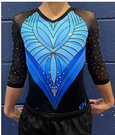
Compulsory for Level 7+ Competition Leotard $350